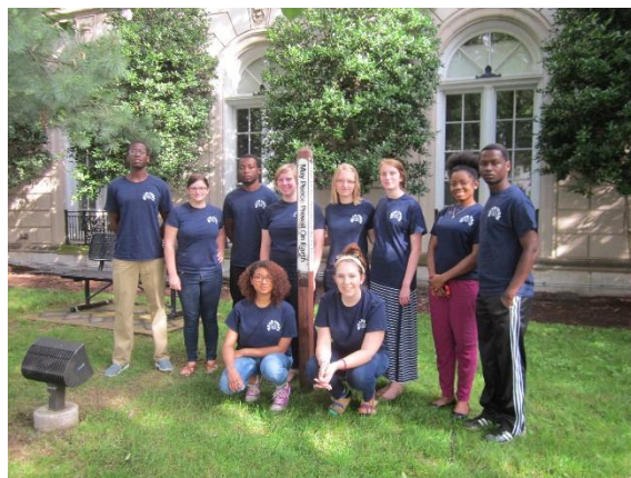
The 2015 Micah Corps team around the Peace Pole at the General Board of Church and Society in Washington, D.C.

Thank you Micah Corps interns! We wish you God's blessings as you continue your life's journey!